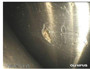
Figure 3: In the spotlight

Combining adaptive articulation with an intuitive interface, the TrueFeel power-assisted articulation of the IPLEX G Lite-W videoscope helps improve the inspector's hand-eye coordination. Good maneuverability and adaptive illumination make it easy to insert through narrow openings without damaging the scope tip.