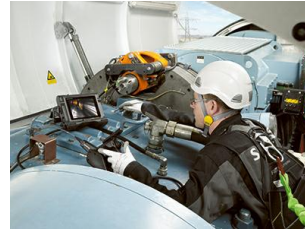
Figure 1: A look in the gearbox

Wind turbine gearboxes are particularly vulnerable to damage owing to their extreme operating conditions. High speeds and high stresses mean that small defects can easily lead to gearbox failure or even to turbine fires. Measurement tools, such as vibration sensors, can monitor potential damage continuously, but only remote visual inspection (RVI) provides a thorough analysis of the state of a gearbox (figure 1). So where does an inspector look when inspecting a gearbox?